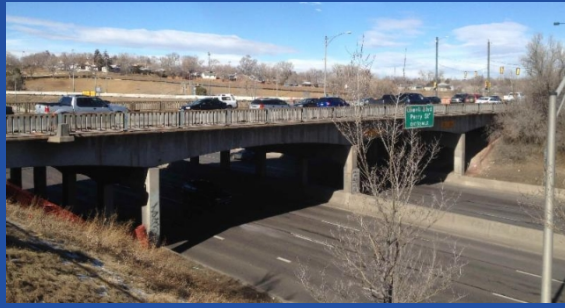
Federal Boulevard bridge over US 6