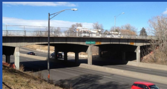
Knox Court bridge over US 6

At its core, this is a multiple-bridge replacement project with the primary function of improving safety and efficiency of travel on US 6, one of the region's busiest highways. The project is set to replace six bridges, each having been identified as either functionally obsolete or structurally deficient. These six bridges include: