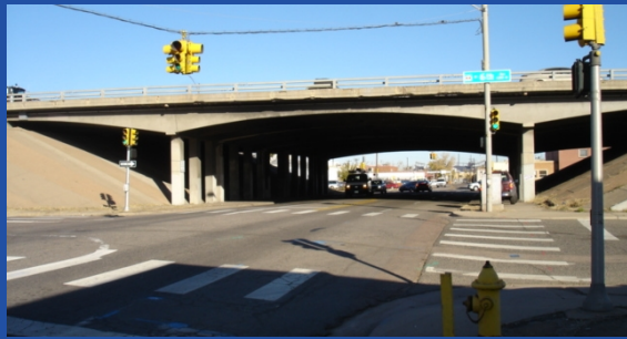
US 6 bridge over Bryant Street