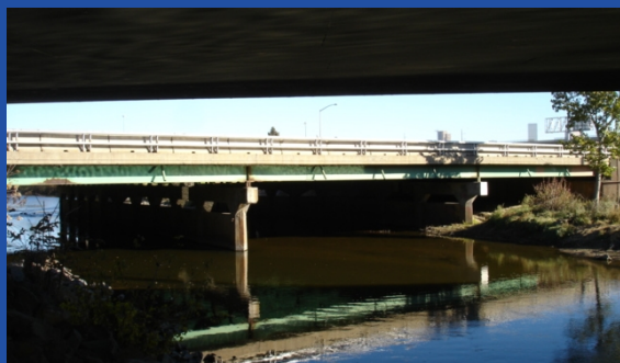
US 6 bridge over South Platte River