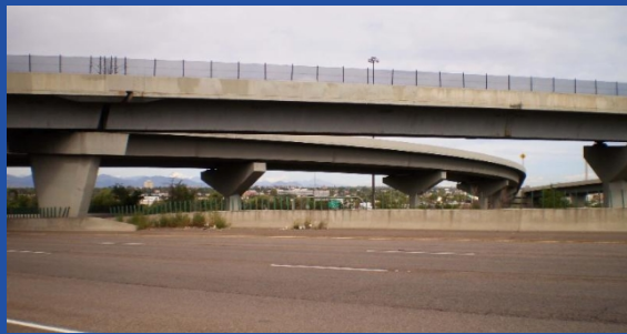
US 6 bridge over I-25